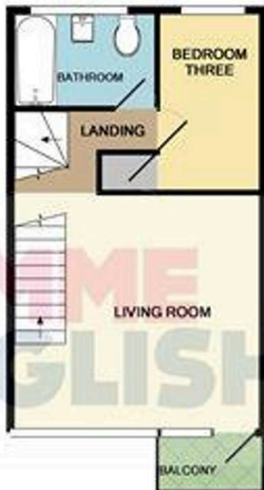
1ST FLOOR APPROX. FLOOR AREA 368 SQ. FT. (34.2 SQ. M.)