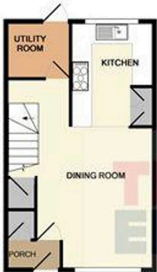
GROUND FLOOR APPROX. FLOOR AREA 368 SQ. FT. (34.2 SQ. M.)