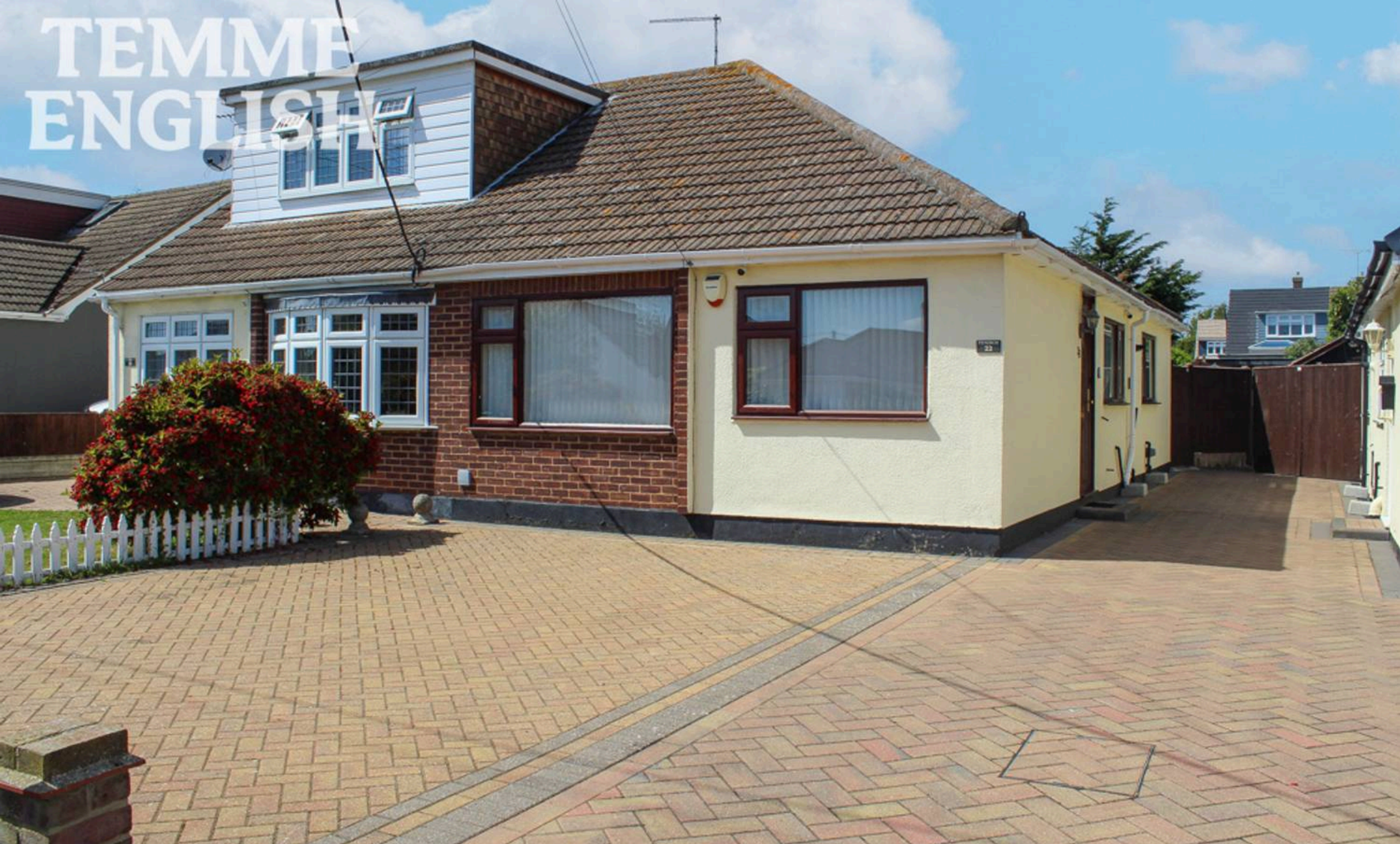
Grange Road, Wickford £375,000